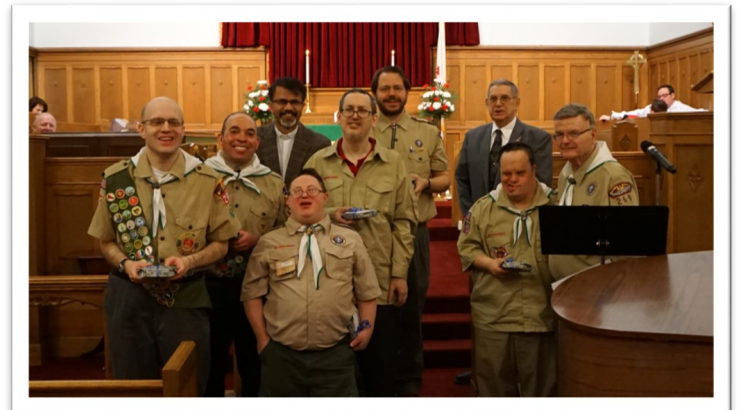
2017 Boy Scout Sunday - Smiles that will brighten your day!

We celebrate Trinity Boy Scout Troop #269 and welcome them as they participate in the service.