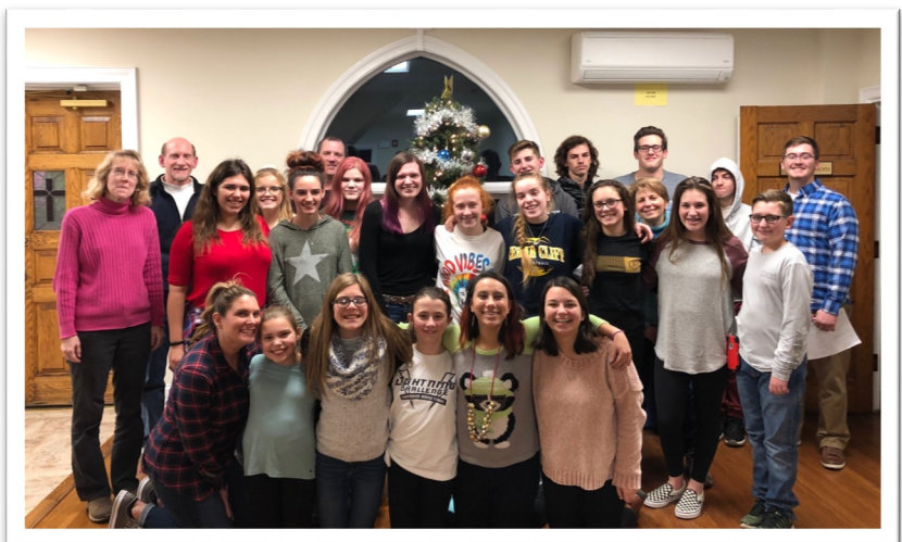
Trinity youth and leaders at their annual Christmas Party