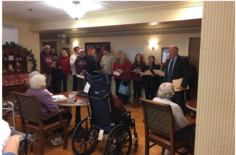
We are thankful for our youth and adult volunteers who visited seniors on Sunday, December 17, 2017 to sing carols and spread Christmas cheer.