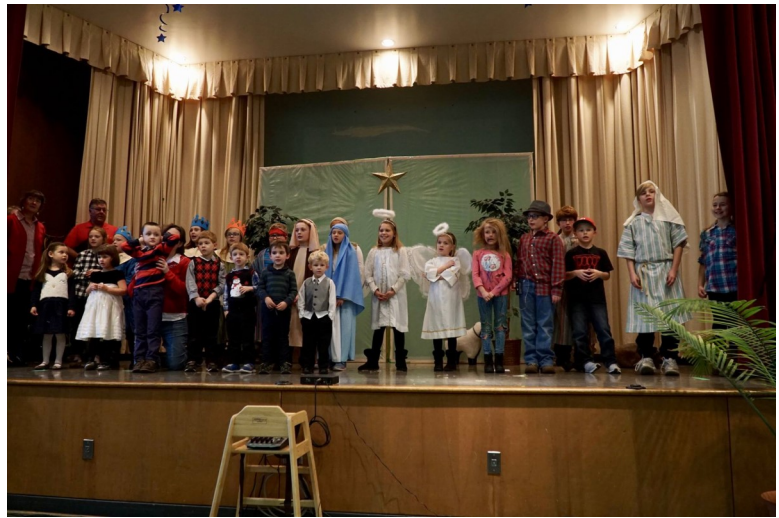
Curtain call for all the children who participated in this year's production of "A Christmas Journey" on Sunday, December 3, 2017