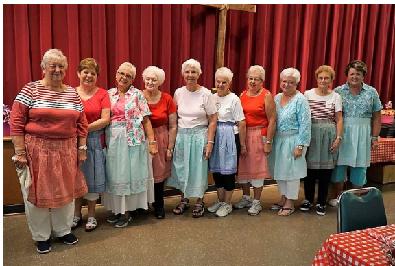
The Homebound Committee modeling their aprons