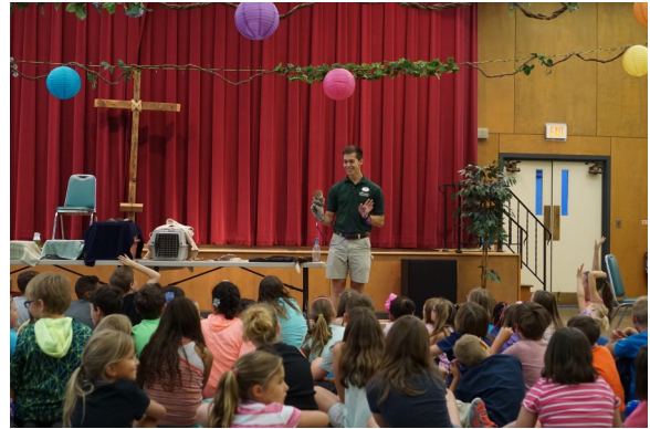
Zoo America's Paws, Claws, Scales & Tails Program

Our last Summer in the SONshine day will be on July 26th. The children will learn how God gives them strength, just like He gave David when faced with Goliath.