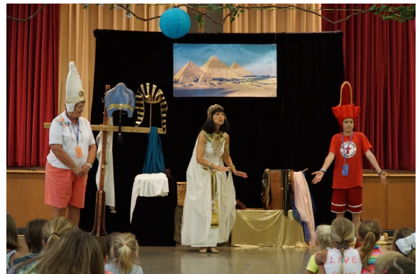
Kit's Interactive Theater - Ancient Egypt

YOUTH GROUP ***** 6-8 PM Youth Group - Creation Room Sundays: August 6, 13, 20, 27 *****