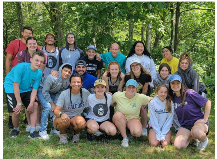
(Impact 2021 with Trinity Youth)