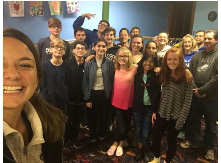
(One of my first photos with Trinity Youth)